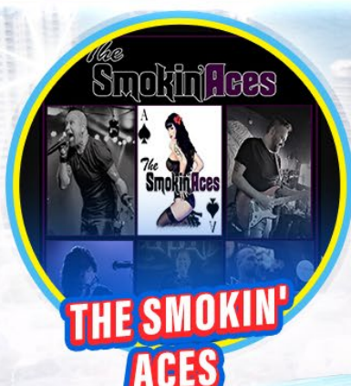
THE SMOKIN' ACES